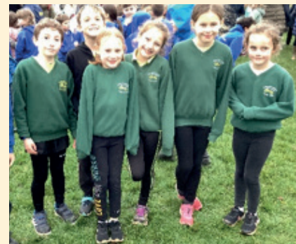
Some of our cross country competitors