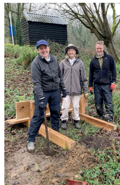
Local residents and volunteers installing and then enjoying the new bench at Frogmarsh