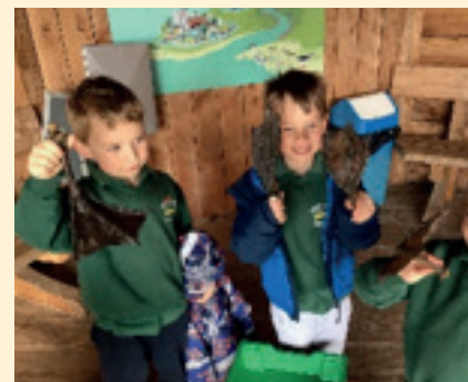
Learning about the natural world at Slimbridge.