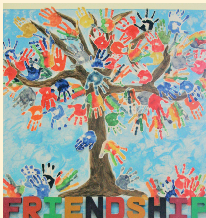
The children learn in a school with a distinct Christian ethos