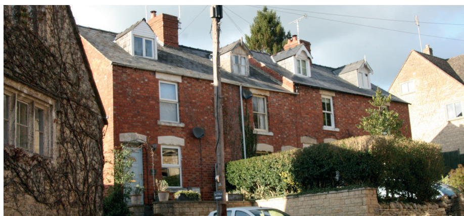
Contrasting buildings in Rooksmoor - 17th/18th century stone built houses with stone tiled roof (top) and Victorian brick and slate cottages (bottom).