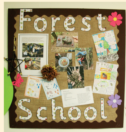
Westonbirt Arboretum display