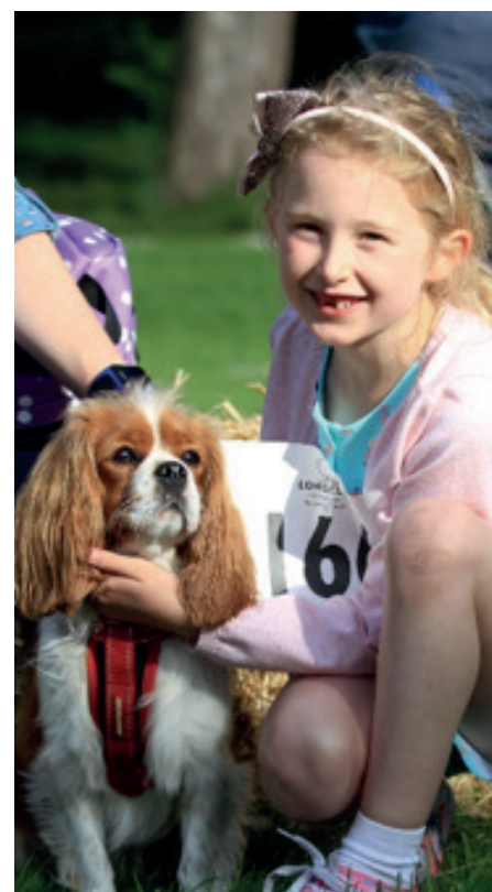
The local community supporting Longfield's walk in 2017 – fun for everyone.