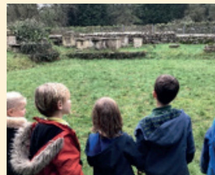
Visiting the site of the Woodchester mosaic